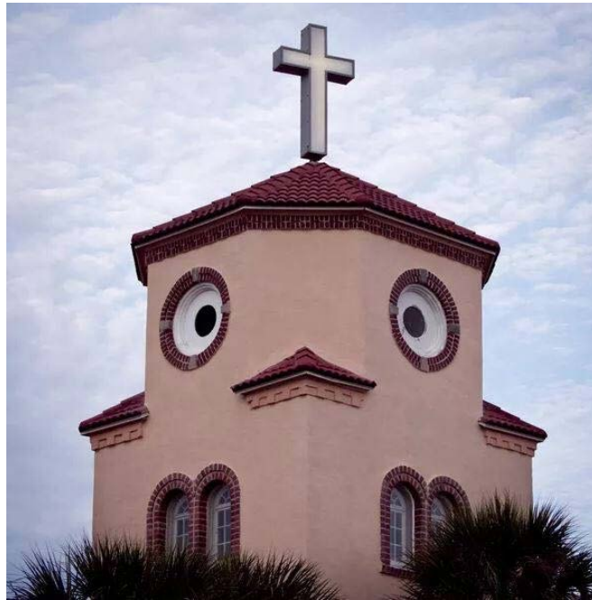
A confused (and confusing) church