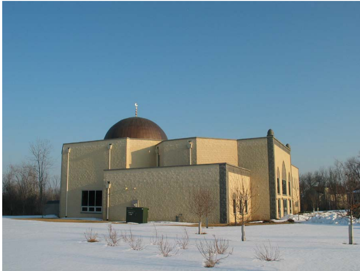
The Islamic Foundation North, Waukegan